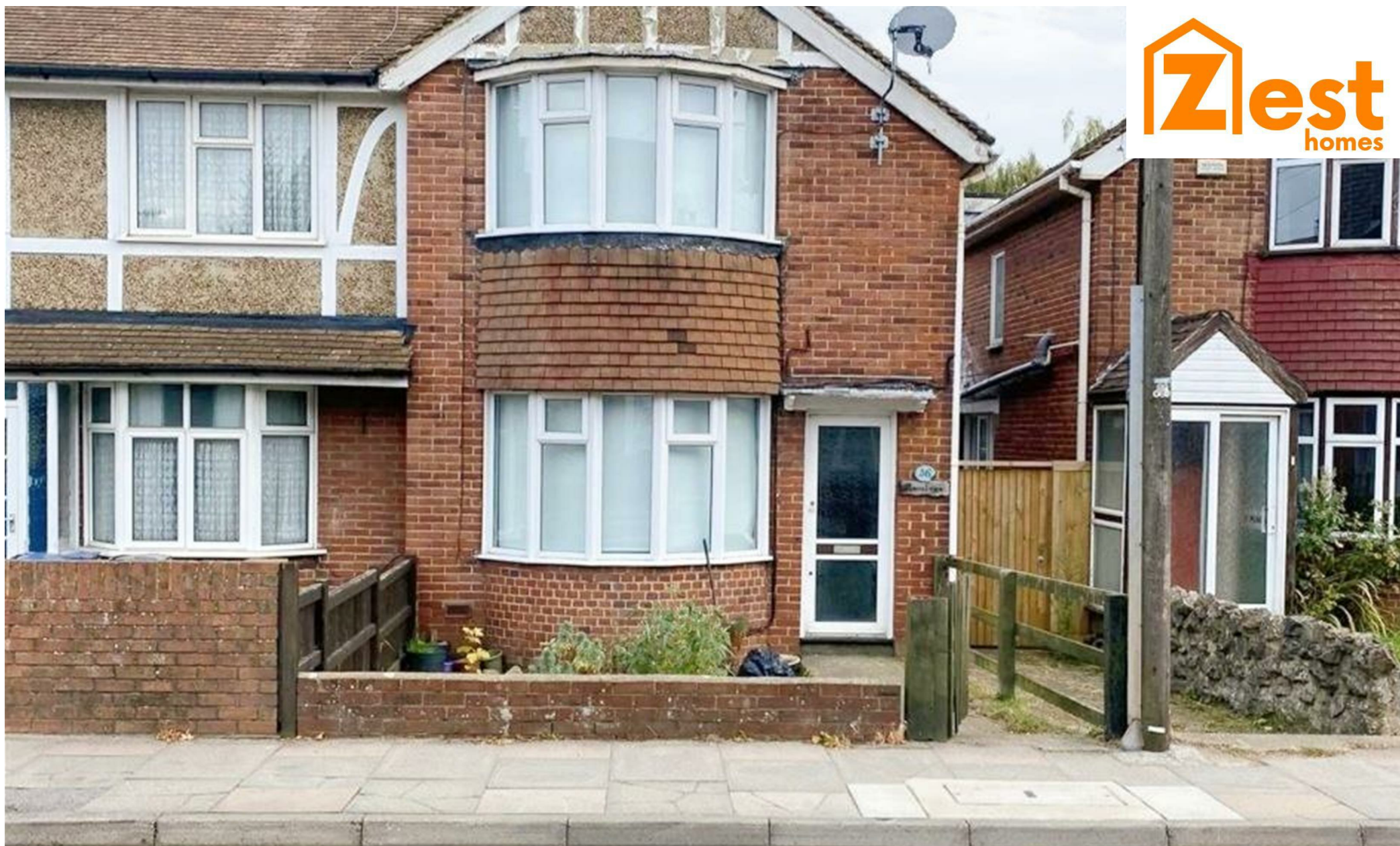
56 St. Stephens Road, Canterbury, CT2 7HU £1,450 Per month